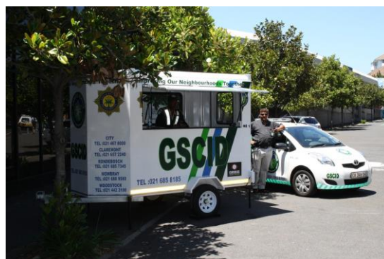
One of our Mobile Security Offices and a Patrol Vehicle

It must also be noted that the four mobile security offices, continue to operate very successfully. They will be moved from strategically located hotspots to other hotspots as a deterrent to crime.